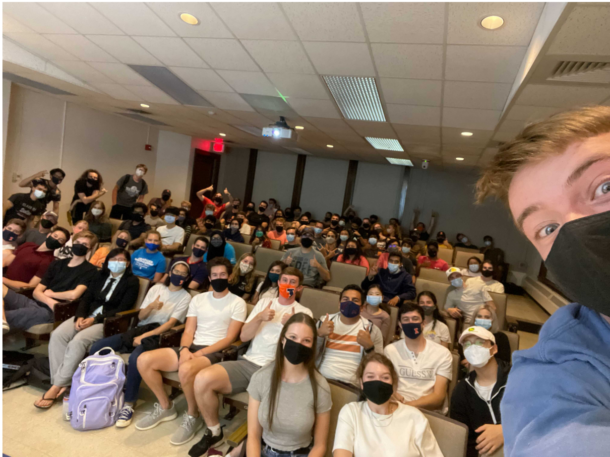
In-person GMs again. Woohoo!

Not all team members were able to return to campus this year, but these members are still able to contribute through design and research projects, as well as having the option to attend all meetings virtually.